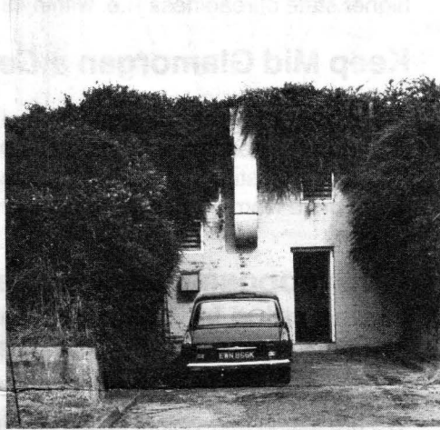
County Bunker, Bridgend Industrial Estate.

They know that Trident and US Cruise missiles will make Britain a prime target in what President Reagan believes could be "a limited nuclear war in Europe using tactical weapons".